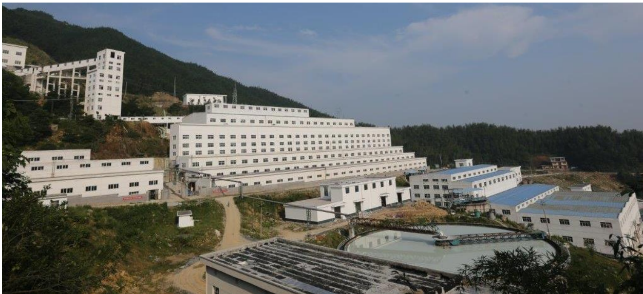
Figure 7: the Yichun mine concentrator complex, China.

While the liquidation of the inventories built up in the 2002-8 period delayed the impact of these closures, demand was exceeding supply. Fortunately, some larger tantalum mines were surviving, including those in Brazil and China, as were several small-scale ‘semi-industrial’ operations, but, without doubt, industrial mine production declined dramatically in 2008.