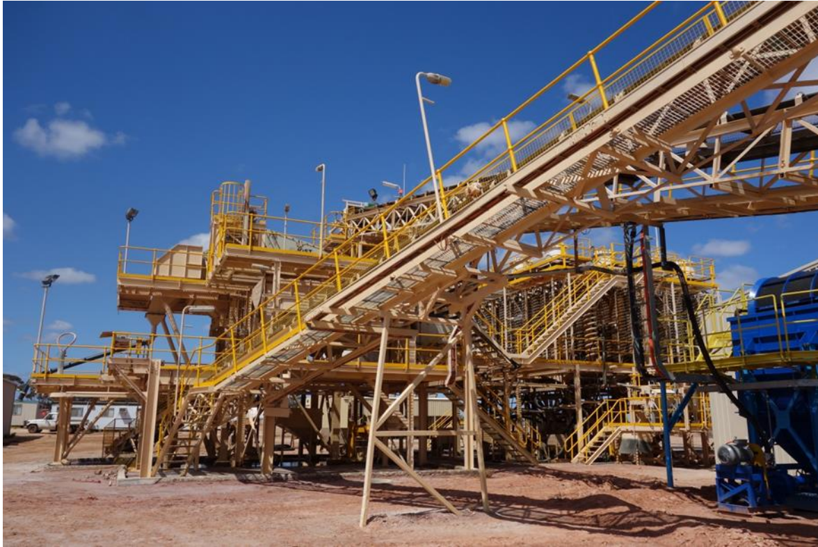
Figure 11: Bald Hill's concentrator, Western Australia.

Worldwide there are scores of small mineralized pegmatites – the author had indeed visited many of them – in North and South America, throughout Africa, Asia and Australia and even some in Europe. Some of them are large enough to warrant development on their own. In other cases packaging several nearby pegmatites together would improve the probability of their development. In these cases using an inexpensive semi-mobile primary plant that could be move from site to site, with a central upgrading plant for cleaning the rough concentrates, would be the answer. An advantage of this scenario would be that each 'package' would not cause a major shift in the supply:demand relationship, and consequent impact on prices.