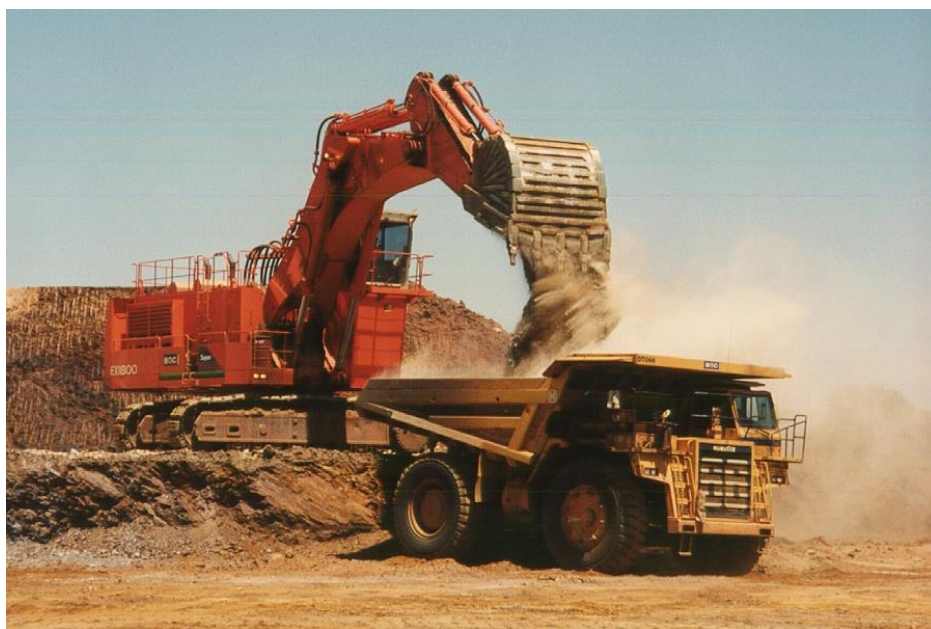
Figure 6; loading ore at Wodgina mine, Australia.

There was a flurry of exploration – from the Arctic circle to southern Africa - and those existing mines that could entered into a period of expansion, notably the two Australian mines owned by Sons of Gwalia (now GAM); Greenbushes and Wodgina. Their increased production neatly came on stream as the dot.com bubble burst early in the 2000's; the market was unable to absorb this and supply outstripped demand for much of the next decade. Artisanal miners moved on to other more profitable minerals and exploration for new mines essentially ceased.