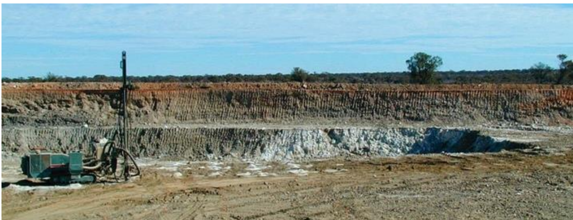
Figure10: The Tabba Tabba pit, Western Australia.

Australia, too, is seeing resurgence in tantalum mining, especially in Western Australia where, several small deposits that have been mined in the past are either close to, or have recently commenced production. These include Mt Cattlin and Bald Hill in the south, and the Tabba Tabba deposit in the Pilbara.