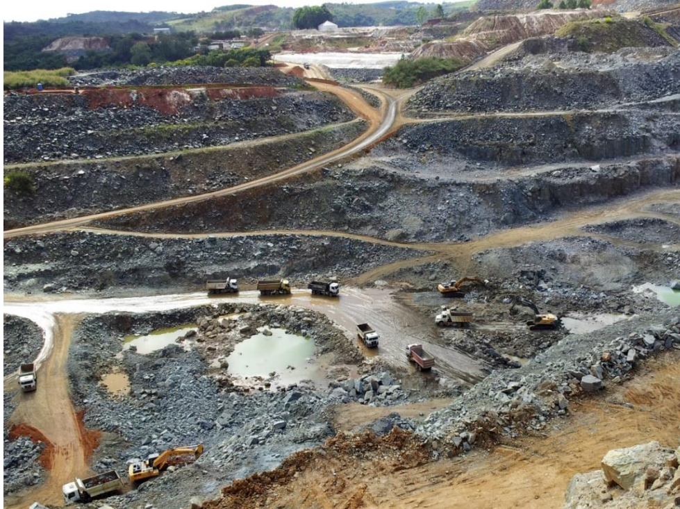
Figure 8: MIBRA open pit, Brazil.

So, if industrial mines were closing, how to fill the gap?