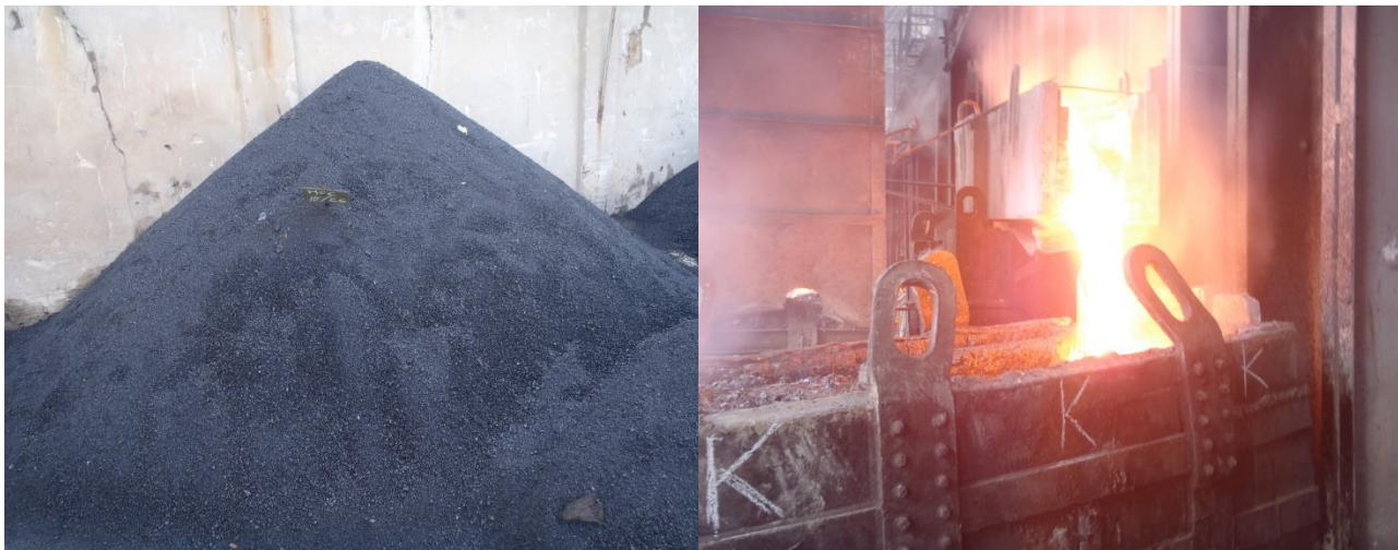
Figure 5: A pile of tantalum rich tin slag, and its treatment.

Higher grade tin slags (those with a Ta_2O_5 content in excess of about 3%) reach the processors directly. When the market is favourable, lower grade slags (say 1-3% Ta_2O_5 ) are converted, usually by pyrometallurgical processing, to a 'syncon' of a tantalum content suitable for standard chemical processing. Some reports suggest that these low grade slags are 'depleted'. This is just not so. It is simply that, when markets are low, syncon production generally slows or stops, as they are a high cost option. Many hundreds of thousands of tonnes of such slags remain, and will continue to be a viable source of tantalum units as and when the market requires.