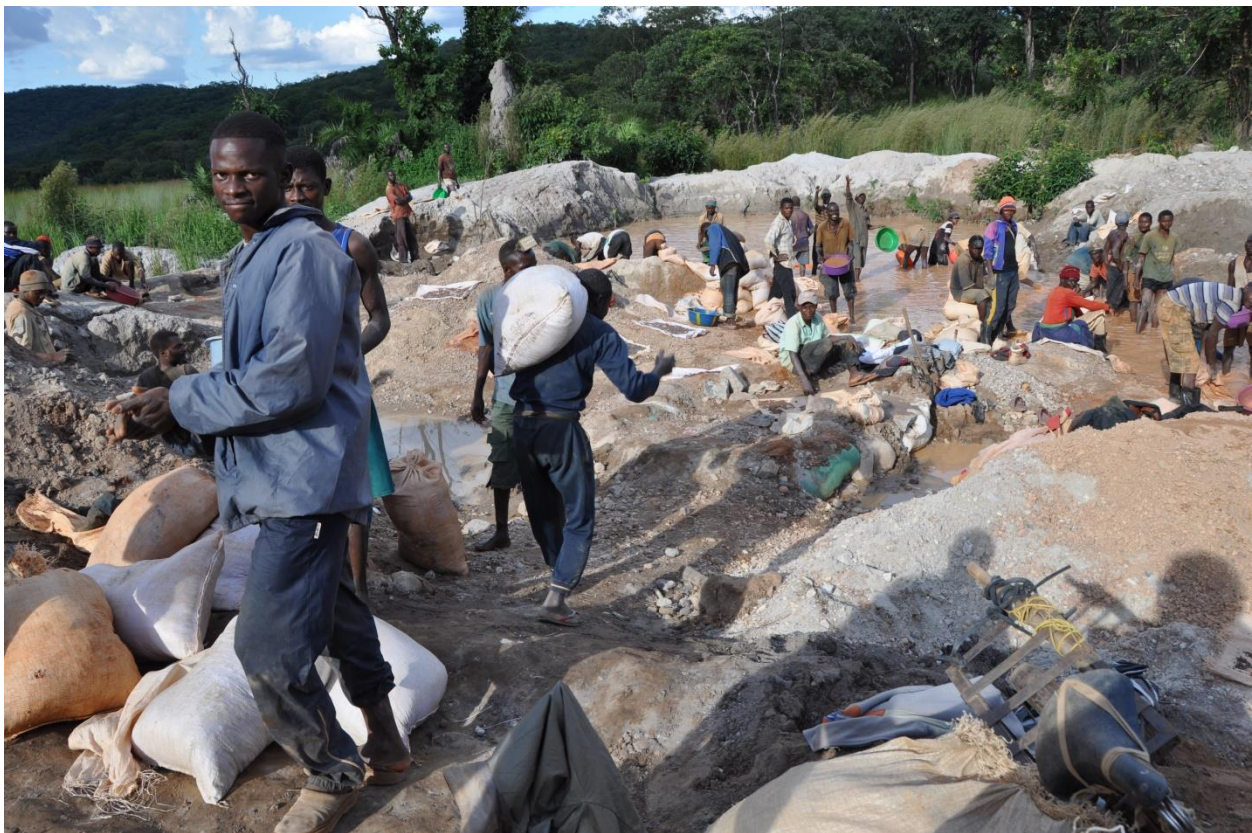
Figure 4: a washing area at a typical artisanal mine, Katanga, DRC.