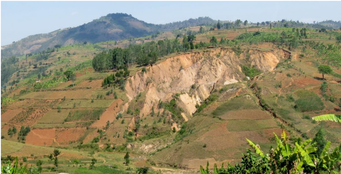
Figure 3: Typical pegmatite, mined artisanally, Rwanda

While that paper cited sources for other information, interestingly, it did not for this one - it is a bald statement, and where it may have originated is ‘lost in the mists of time’. However, this figure (and the derivative – that 65% of the world’s resources are in the DRC) took on its own momentum, morphing into ‘‘DRC contains 80% of the world’s entire coltan resources’’ (Parkinson 2006, and others).