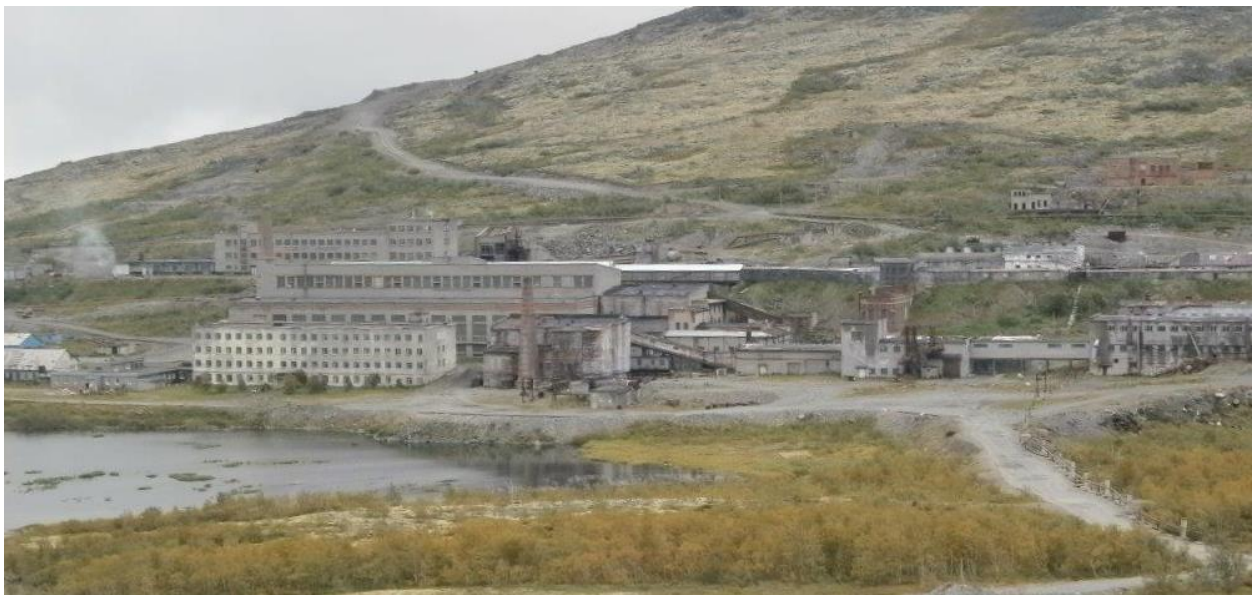
Figure 1: The Lovozero metallurgical complex, northern Russia

Syenites are another form of alkali feldspathic rock, with dominant nepheline syenite (itself a valuable mineral used in glassmaking). They are often 'ring' formations (somewhat reminiscent of an onion skin), and generally highly complex. The Lovozero deposit in northern Russia is a prime example of an operating mine where tantalum, and niobium, are lesser albeit important by-products. Of potential interest are the Nechalacho deposit in Canada's Northwest Territories, and the Motzfeldt complex in southern Greenland.